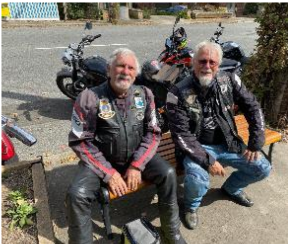
Ulyssians Grey Bearded Gentlemen