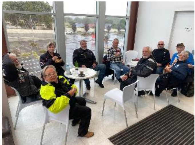
Lunch at McLaren Vale Barkery