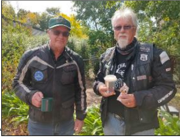
'Rascally Roger' returns to the fold chewing the Fat over morning tea at Echunga