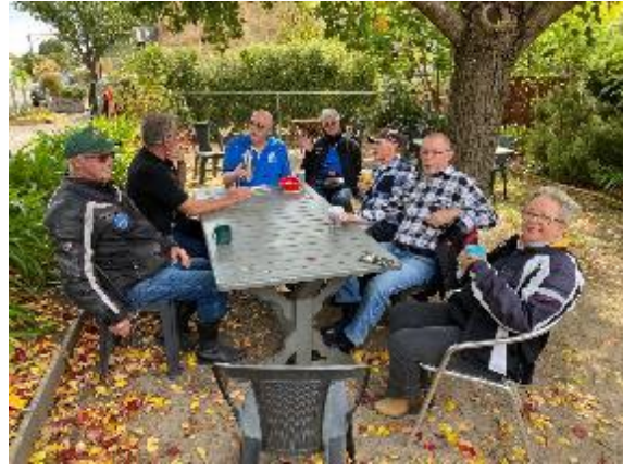
Echunga rest after 80 mins of twisty riding